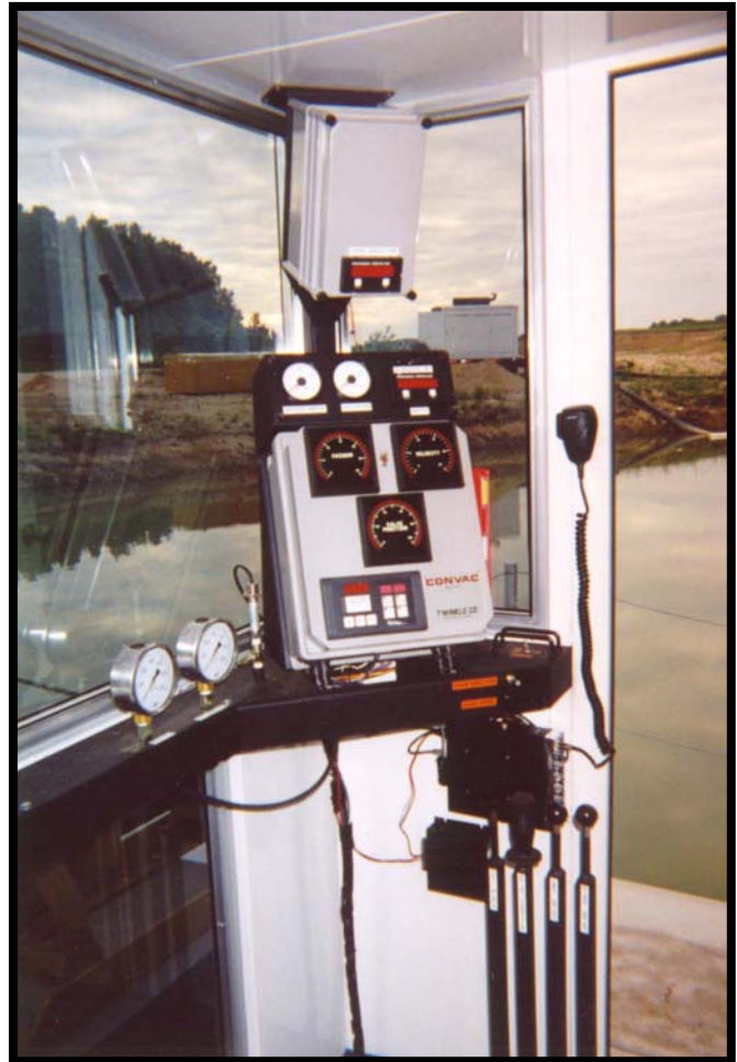
CONVAC control & display panel shown in a cab setting