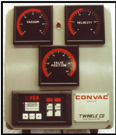
CONVAC control & display panel