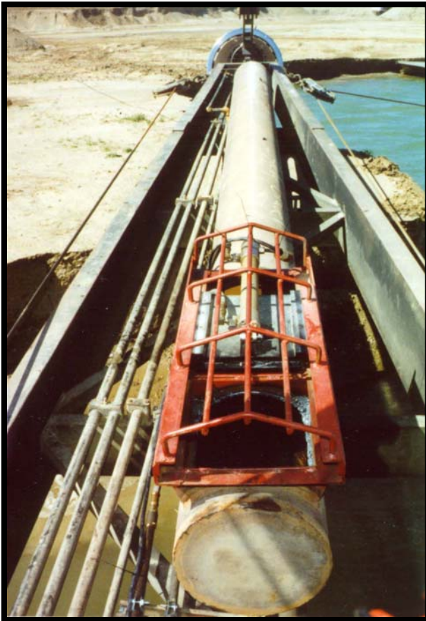
CONVAC slide valve shown on a cutterhead ladder