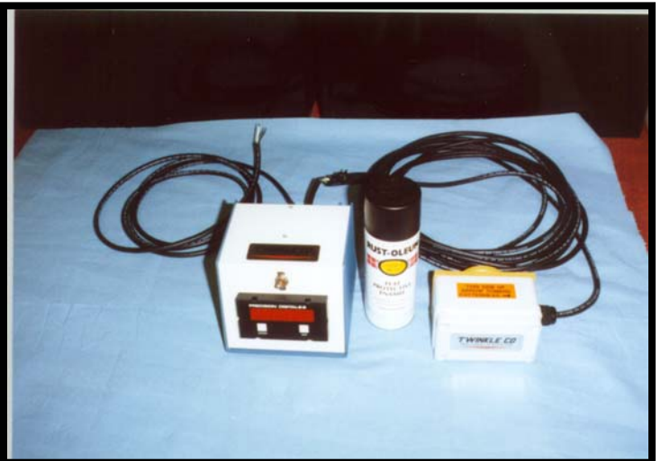
HOWDEEP display with signal brick shown with a standard size can of spray paint.