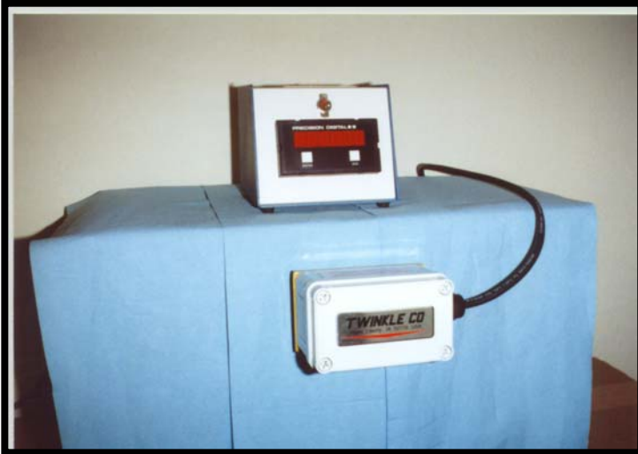
HOWDEEP display with signal brick level and indicating 0.0 feet digging depth.