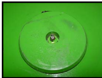
Extreme duty shaft with recessed grease zerks.