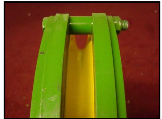
Replaceable cable guides