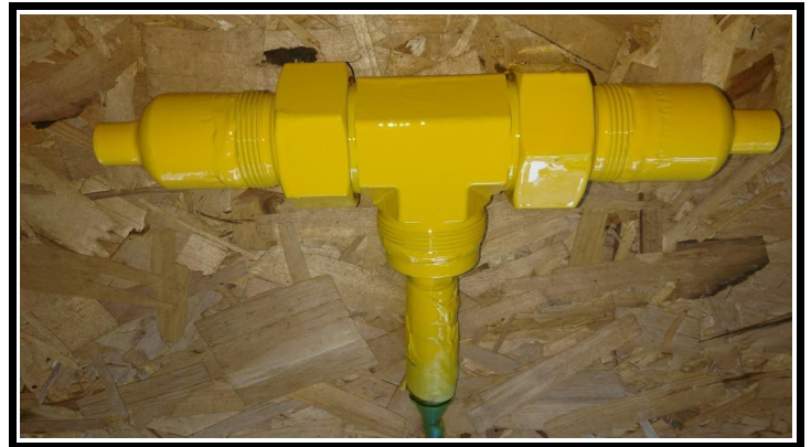
HEADHAWK sensor housing to be mounted near the submerged housing that is to be monitored