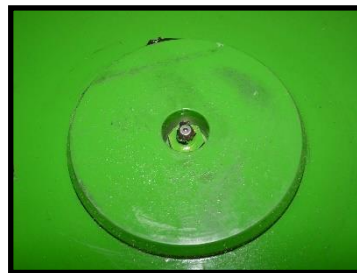
Extreme-duty shaft with recessed grease zerks.

MOAB (Multiple Operating Angle Block) is designed for use in the demanding environment of dredge positioning cables. MOAB works equally well above or below water. Sheave cable grooves are flame hardened for long life. The extreme-duty shaft is fitted with a recessed grease zerker in each end to allow greasing regardless of mounting angle. The replaceable cable guides insure that slack cable will not wedge between the sheave and the block side plates, preventing damage to the cable and the block. Modular design allows blocks to be quickly assembled from stock components for fast delivery and easy repair. Approximate weight per block is 165 pounds.