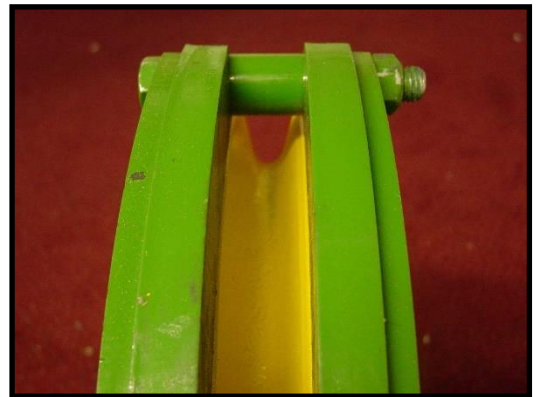
Replaceable cable guides